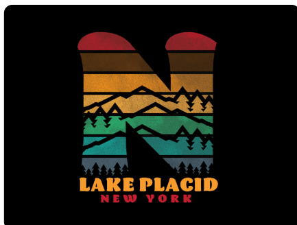
ND 2537 Screen Print