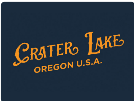
ND 99966 Left Chest EMB