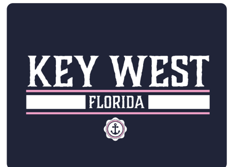
ND 2537 Screen Print