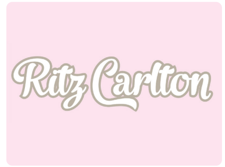
ND 99952 Laser Applique