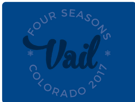
ND 99971 LA/Screen Print