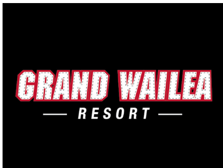
ND 99960 Laser Applique