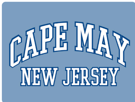
ND 2097 Screen Printed