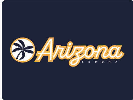
ND 99996 Laser Applique