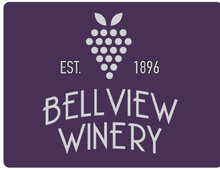
ND 99981 Left Chest EMB