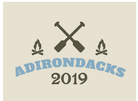
ND 99976 Left Chest EMB