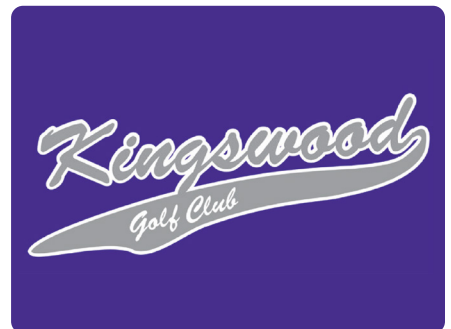
ND 99688 Laser Applique