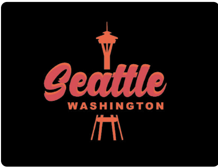
ND 2498 Screen Print