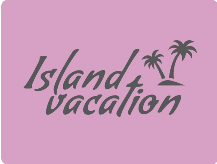
ND 99975 Left Chest EMB