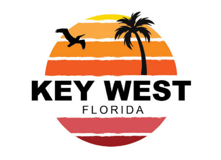
ND 2490 Screen Print