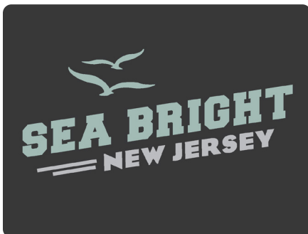
ND 99985 Left Chest EMB