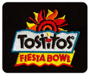
12,721 STITCHES Vantage optimizes stitch usage for best appearance and production efficiency.