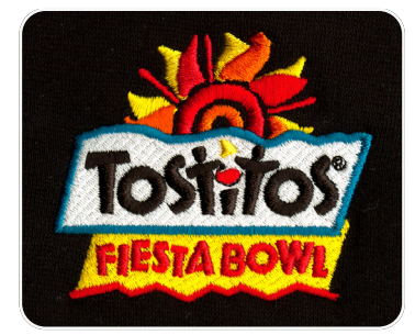
16,912 STITCHES Padded logo with unnecessary stitches that cost you more.