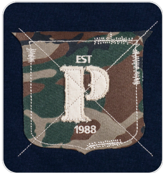
Twill & Cotton-Rib Patch Name-Drop #99799