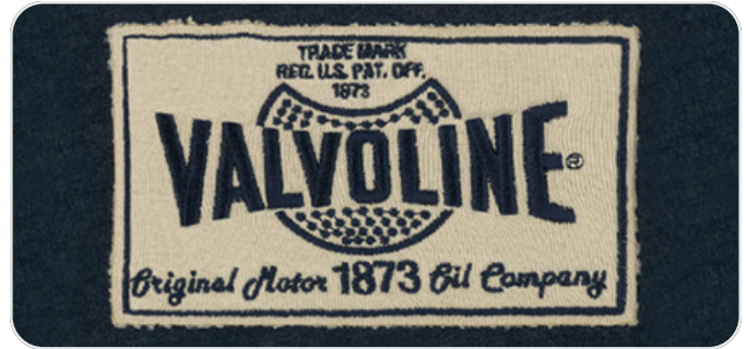
Cotton-Rib Patch Name-Drop #99796

Our patches use laser appliqué and embroidery to offer a fun, fashion embellishment on your hoodies and other garments. Choose from pre-designed layouts or supply your own artwork. Patches are approximately 4" X 4" and can be created with any of the stock appliqué fabric.