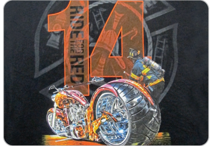
Simulated 4-Color Process